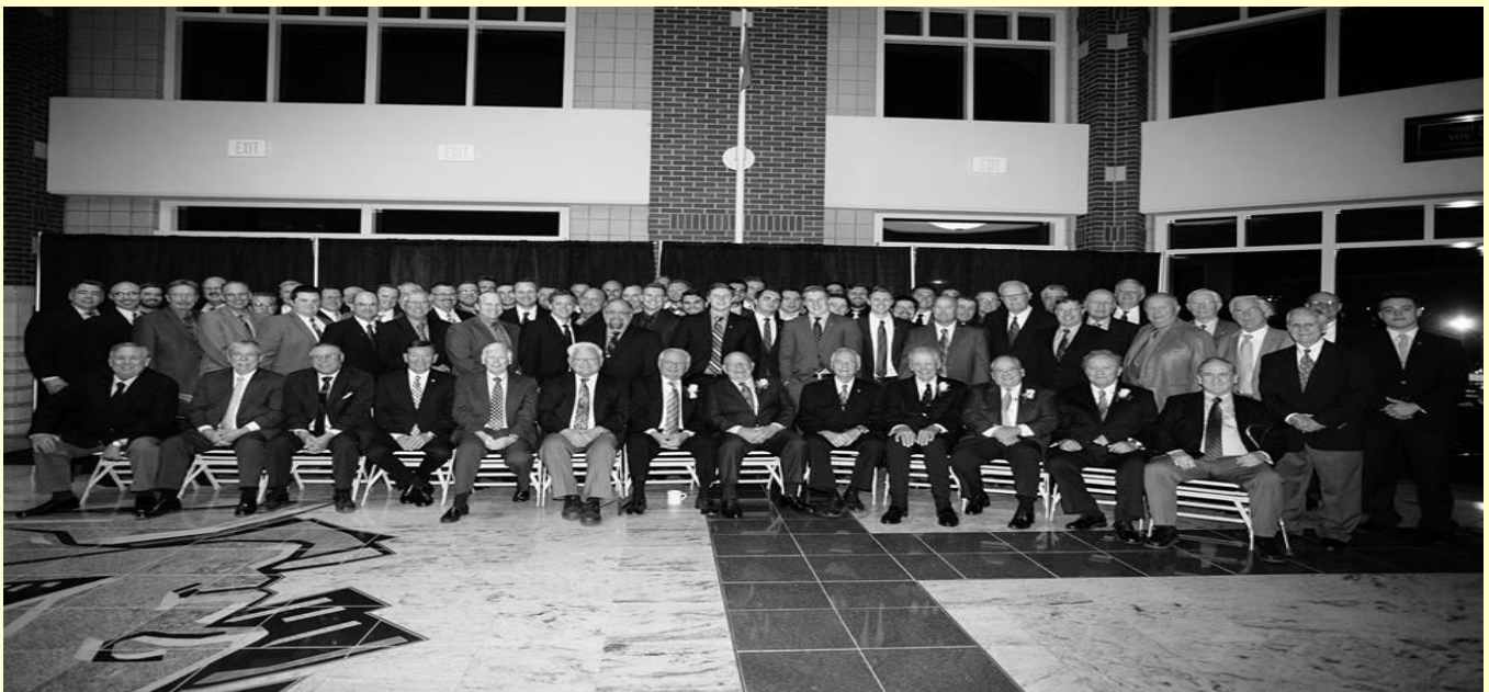
85 th Anniversary group photo.

https://undalumni.org/alumni-homecoming-events